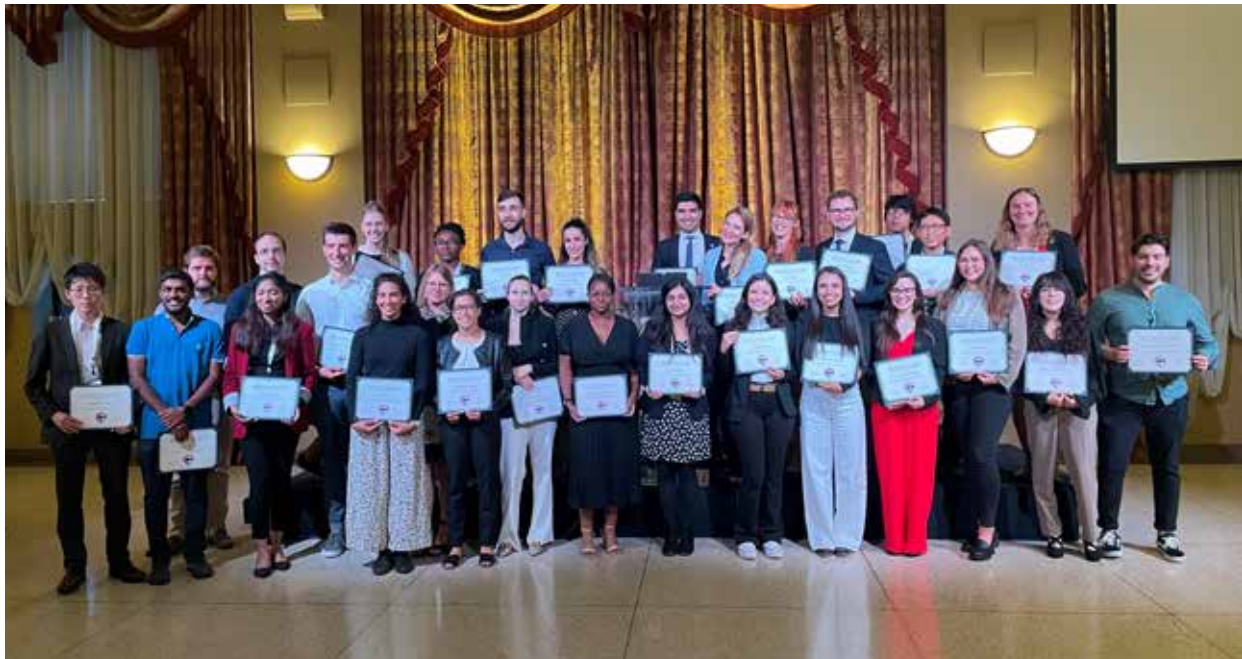
Travel Grant Awardees at the 2023 Symposium in Hamilton, Ontario, Canada