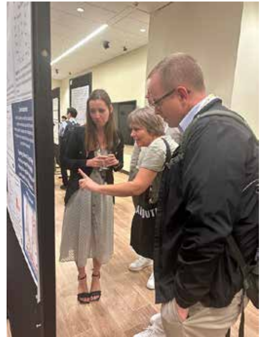
2023 Symposium Poster Session - Hamilton, Ontario, Canada